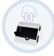
Remote Therapy Adjustments