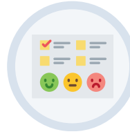
Quality of Life Questionnaire