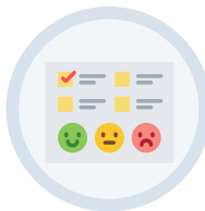
Quality of Life Questionnaire