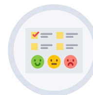
Quality of Life Questionnaire