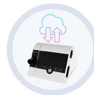
Remote Therapy Adjustments